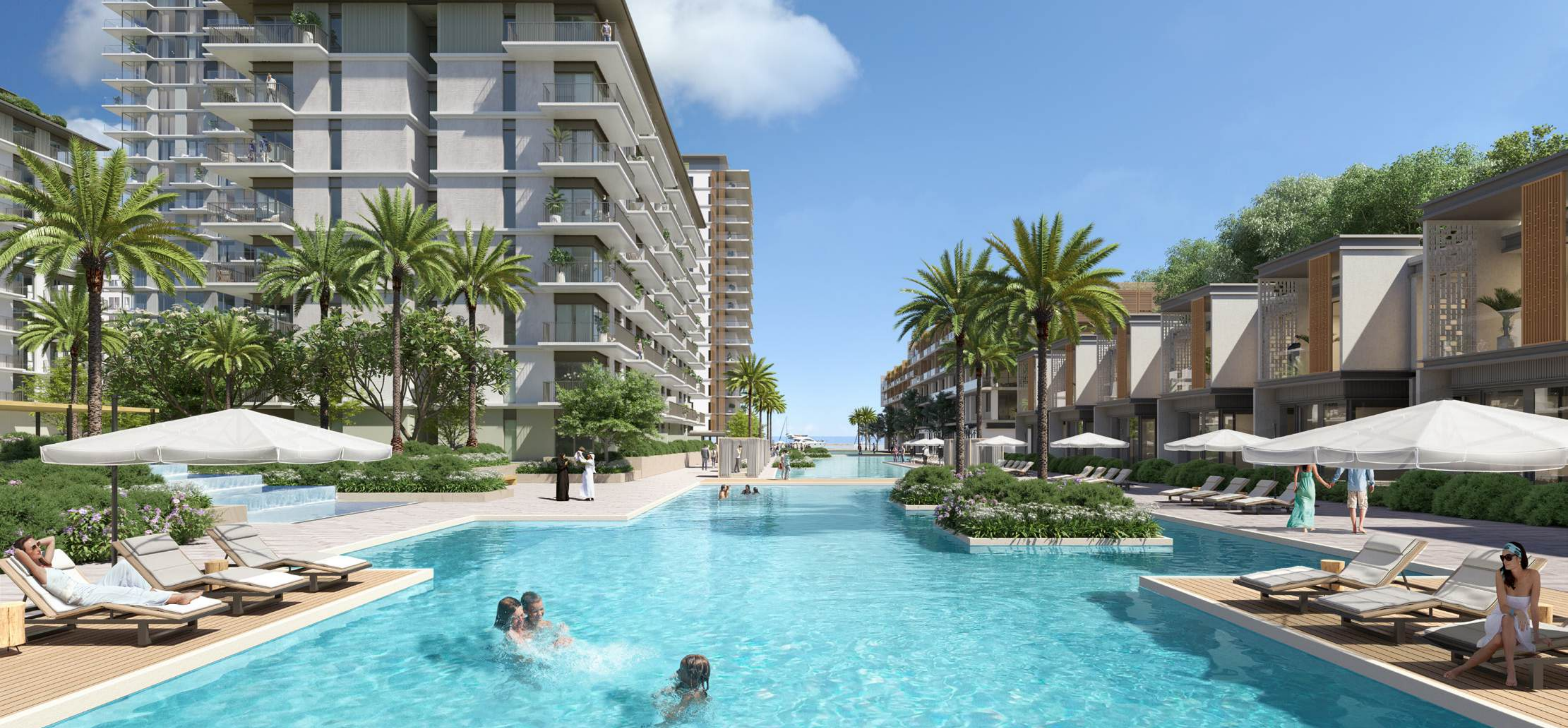
The Canal Pool